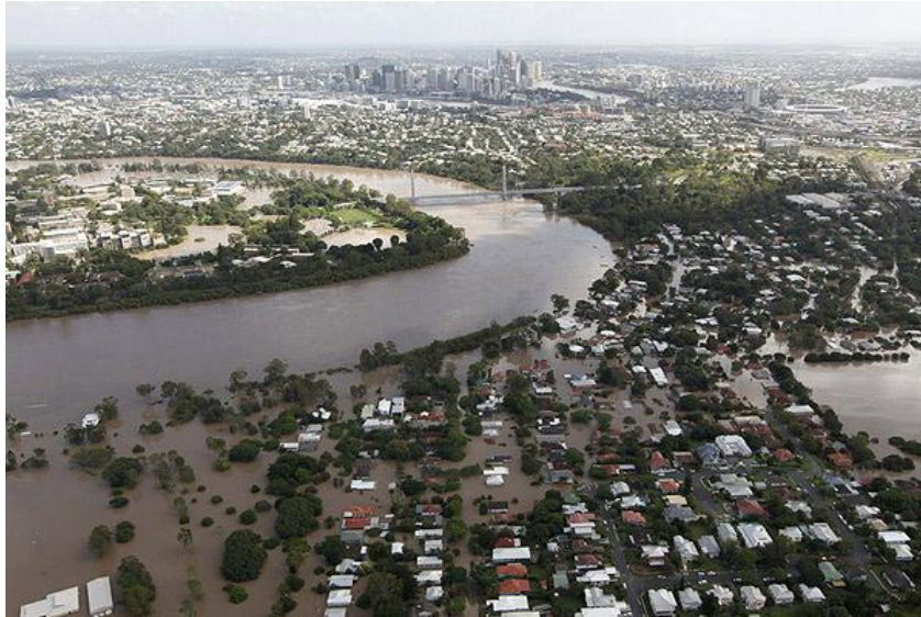
Figure 3: Flooding within Brisbane suburbs in 2011

However, following the flood event, as examined by Raymond (2011), the public perception, driven by media coverage, was that the dam had failed to prevent flooding, without any understanding of the complex interaction between downstream tributaries and the limitations of the existing infrastructure. Managing flooding downstream of Wivenhoe Dam is difficult because the water released from the dam combines with other rivers downstream of the dam. Floodwaters from Lockyer Creek and the Bremer River enter the Brisbane River downstream of Wivenhoe Dam and therefore cannot be controlled by the dam. These downstream rivers alone can cause significant flooding in Ipswich and Brisbane.