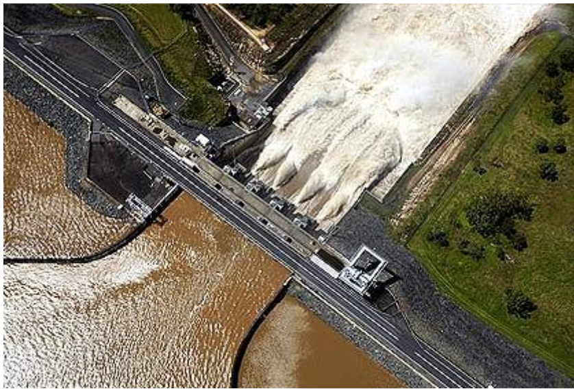
Figure 2: Wivenhoe Dam during 2011 floods

Somerset Dam on the Stanley River and Wivenhoe Dam on the Brisbane River were constructed to provide both urban water supply and flood mitigation. Somerset Dam is located upstream of Wivenhoe Dam. The two dams have a combine storage volume of 1.4 GL used for water supply and over 2.6 GL of temporary flood storage available to provide flood mitigation and to ensure that the dams have adequate flood capacity. The dams are operated to meet a range of flood mitigation objectives including impacts on the rural community, urban flooding and dam safety. Both dams have gated spillways which allow the dam operators to have some control over the discharge from the dam during a flood. The degree of control the dam operators have is dependant upon the and the size and type of the flood event.