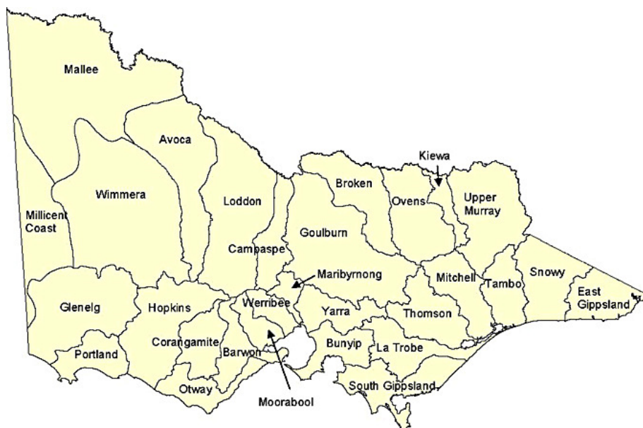
Figure 1: Major River Basins in Victoria

Version 3P of the Tool is a major rework of the two previous versions. Using essentially the same range of data, this version disaggregates the basins (shown in Figure 1) into specific at-risk locations and river reaches. The locations and river reaches are as advised by the relevant Catchment Management Authority (CMA) and align with the at-risk locations and river reaches for which flood risk data is derived.