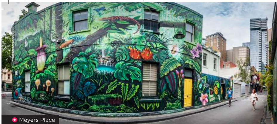
★ Meyers Place