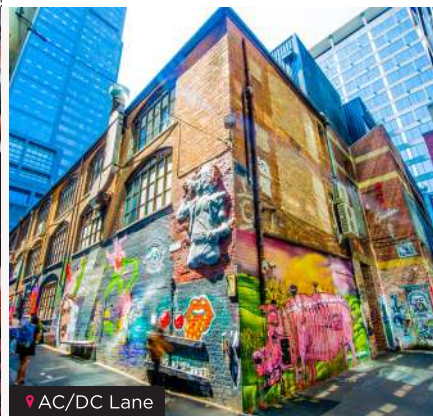
♥ AC/DC Lane