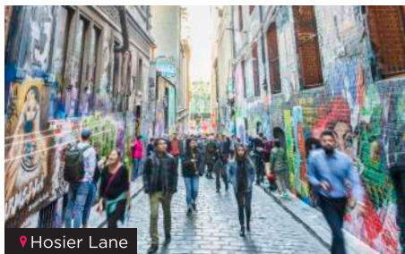
♥ Hosier Lane

Melbourne's first official street art precinct is opposite Southern Cross Station. The precinct, curated by the Juddy Roller collective, showcases some of the biggest names in town including Adnate and Rone.