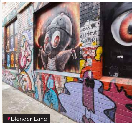
♥ Blender Lane