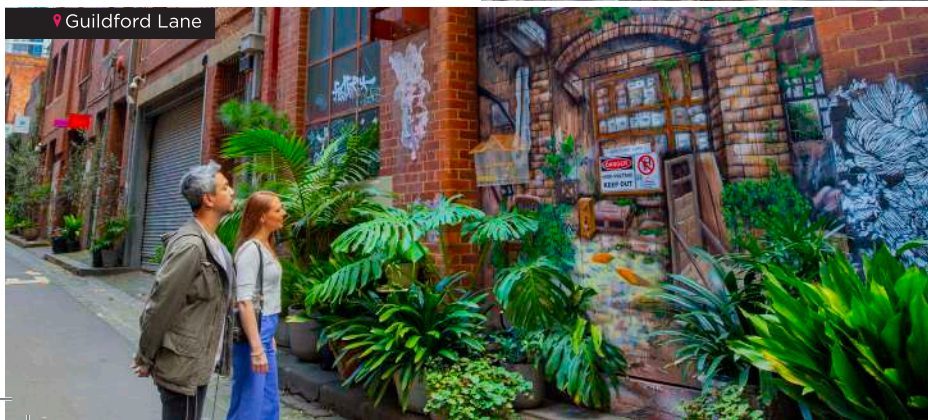
♥ Guildford Lane