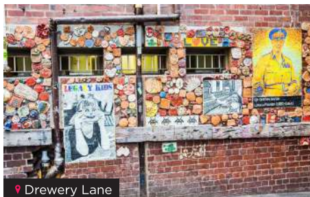
♥ Drewery Lane