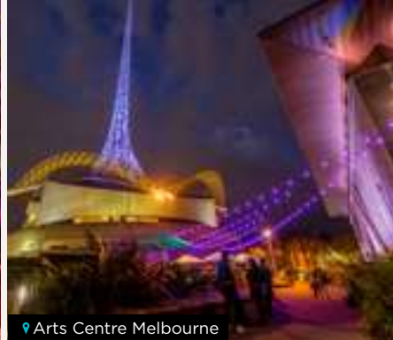
📍 Arts Centre Melbourne