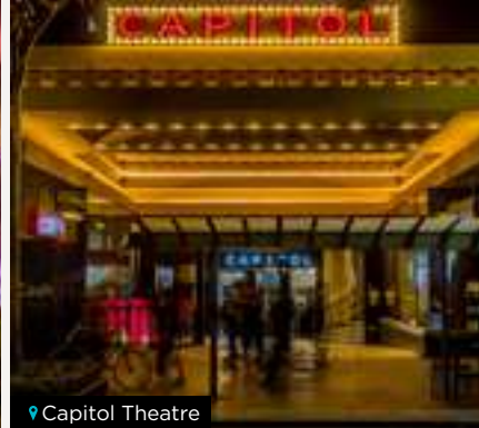
📍 Capitol Theatre