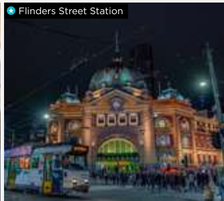
📍 Flinders Street Station