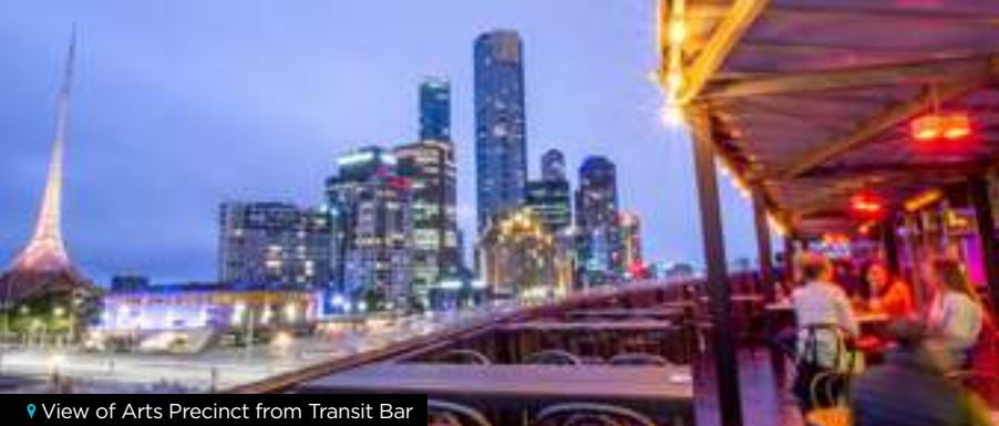
📍 View of Arts Precinct from Transit Bar