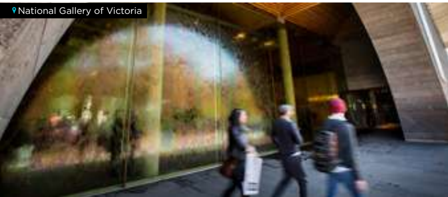
📍 National Gallery of Victoria